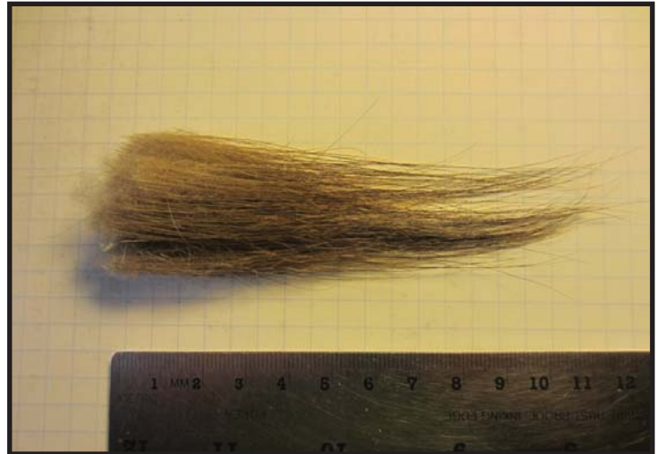
A little tuft of elk pelage

American elk, also called wapiti, are members of the deer family. The Lords Park Zoo herd grazes in an enclosure of several acres. The herd is small and the habitat is large but, it is not large enough to sustain the animals without supplemental food. The wapiti are given free choice hay and a daily ration of livestock feed. Zoo practice requires this supplemental feeding to ensure animals that cannot move to new pastures have adequate food and complete nutrition. Wapiti are herd animals. Being part of the group is essential to their health. Herd life is usually peaceful. The herd grazes with everyone moving slowly in the same general direction as a loose group with ten to thirty feet between individuals. In contrast, the morning feeding is somewhat frenetic and although the keepers use several feeding stations to make sure all the animals have access to feed and hay there is usually some jockeying for best position. Dominant animals will defend their personal space and their