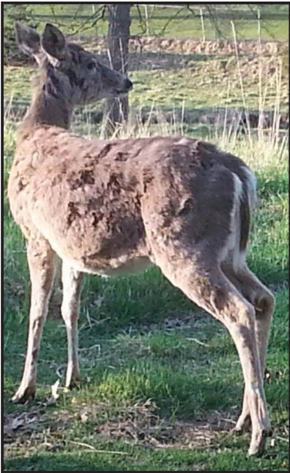
Ragged deer coat in Lords Park Zoo

The animals look a little ragged now. A little ruffed up and worn out. Patches of fur are missing here and there. A day will come when standing in a shaft of sunlight