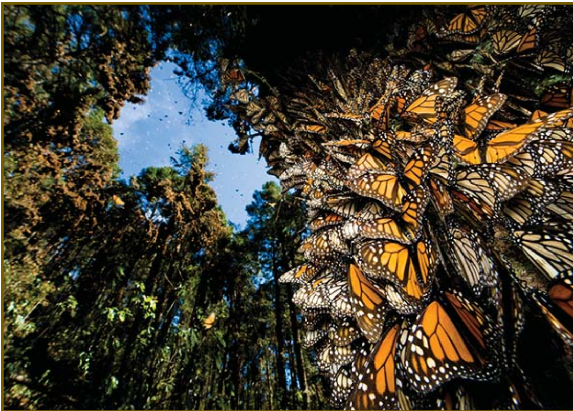
Monarchs overwintering on the oyamel firs of Mexico

Covering the boughs, the butterflies roost on the oyamel firs by the tens of thousands. Even though these are hardy trees, sometimes a branch will break with the weight of