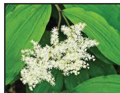
false Solomon's seal