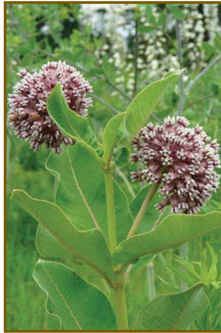
Common Milkweed can be seen in the Savannah Garden by the Museum and in the deer & elk pens of the Zoo in Lords Park.

fewer milkweed plants perhaps in part because of the inclusion of “weed” in its name. People generally don’t see it as a plant